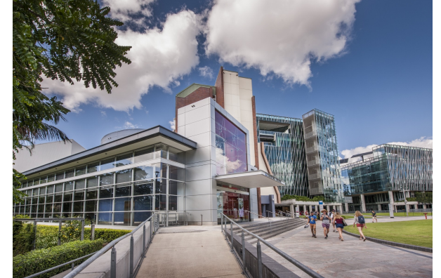
The AFT was developed the Queensland University of Technology